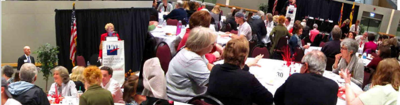
Five of the instrumental team that made the Voters' Rights Summit such a success! Now those are happy faces! 1/7/17